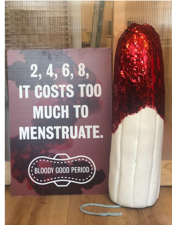
Our iconic sparkly tampon in all its glittery glory.

P.S. Feel free to use our Bloody Good Fundraising Logo!