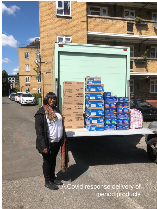
A Covid response delivery of period products

Product deliveries during the first UK lockdown, 2020