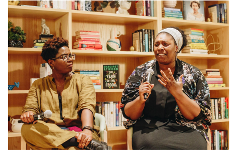
Getting our bloody activism on! Examples of our activities shown.

We believe that people who need them should be able to access menstrual products for free - just like toilet paper. We believe that “period poverty” is part of a wider sphere of menstrual and gender inequality, and are working hard to make ourselves obsolete!