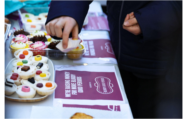
Bake sale success at Taverham High School!

Who doesn't love a baked treat to make the school day more exciting? Taverham High School partnered with local organisations to run a bloody brilliant bake sale for Bloody Good Period, raising hundreds of pounds. The students also designed some amazing artwork to advertise the sale. Thank you, Taverham High School - we think you're ace!